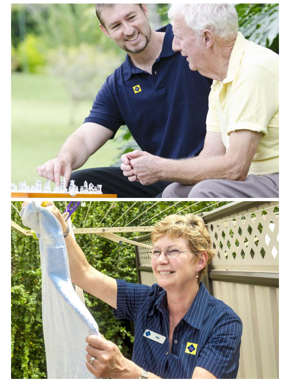
This is an image of HomeCare.

Please feel free to contact us on 1300 076 566 to talk about your care and support options, or if you ever find life at home too hard, we can assist on 1300 781 775.