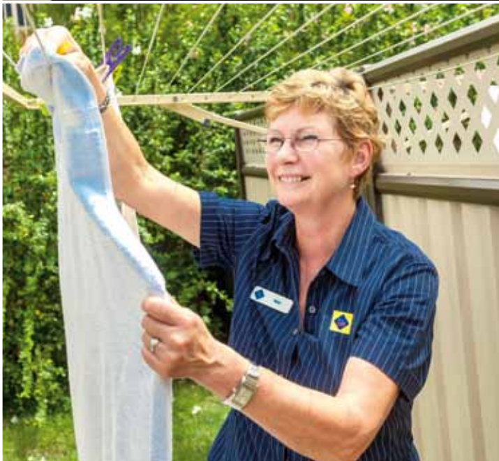
This is an image of HomeCare.