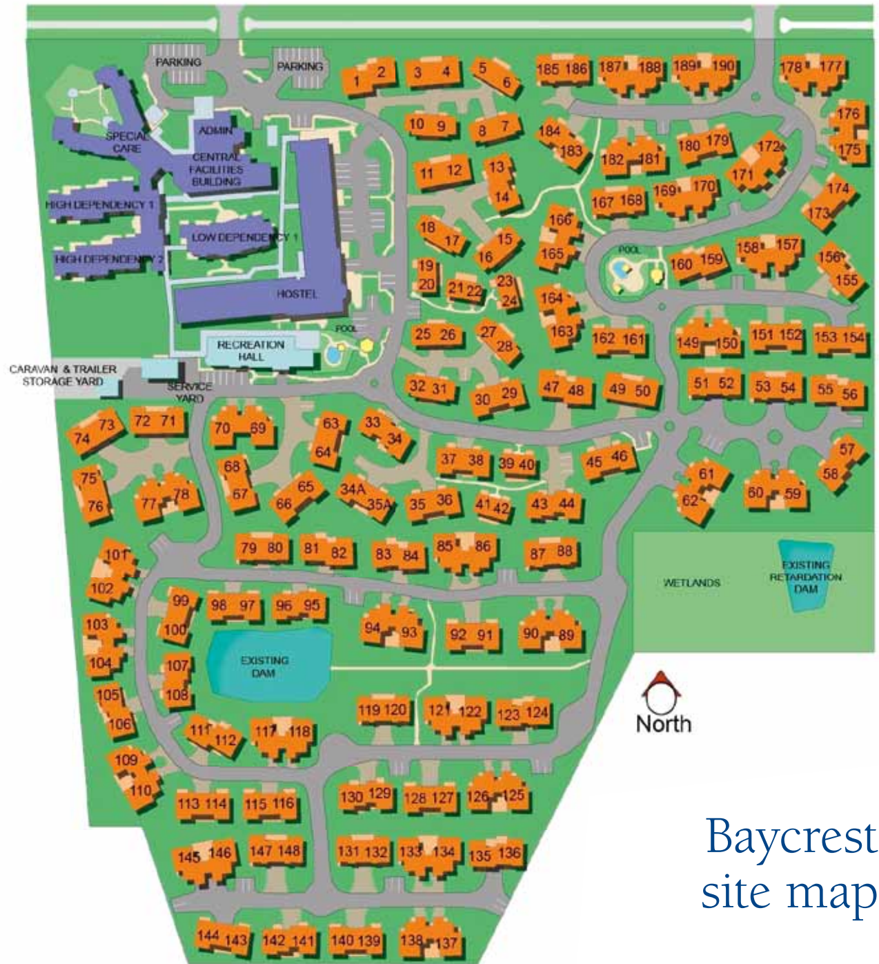
Baycrest site map