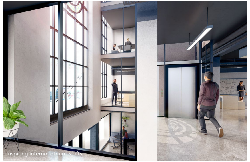
Inspiring internal atrium & lifts