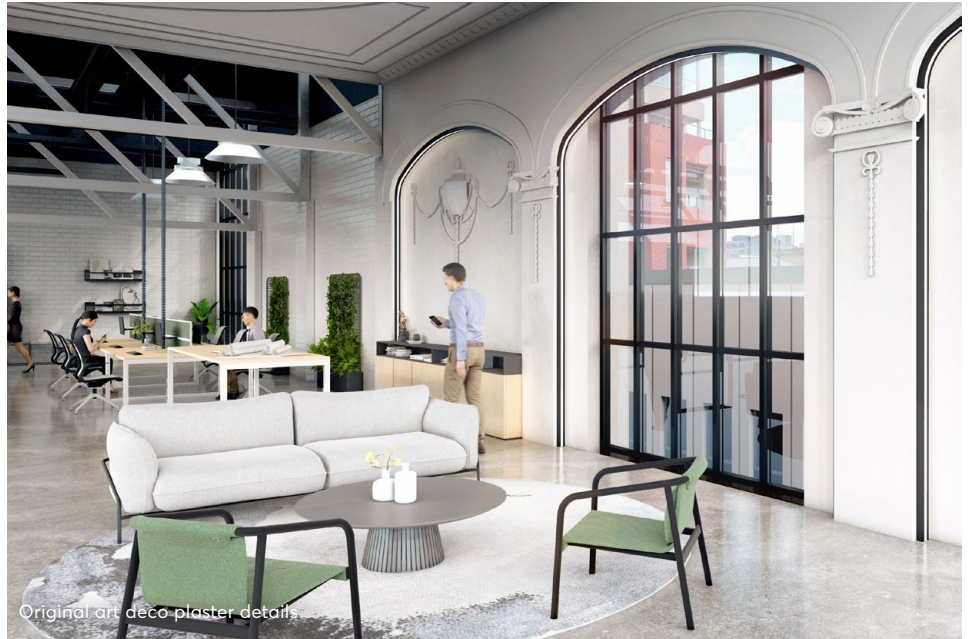
Original art deco plaster details