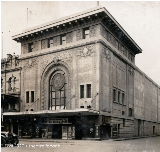
Lost 1920's theatre facade