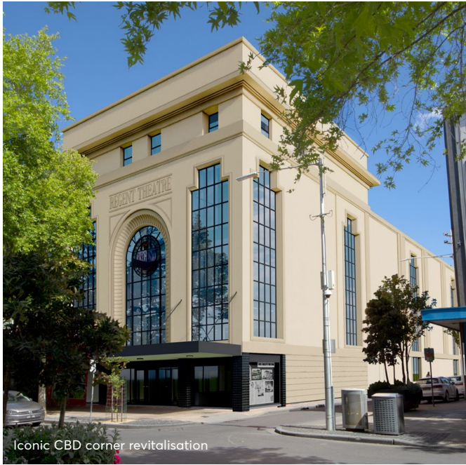
Iconic CBD corner revitalisation