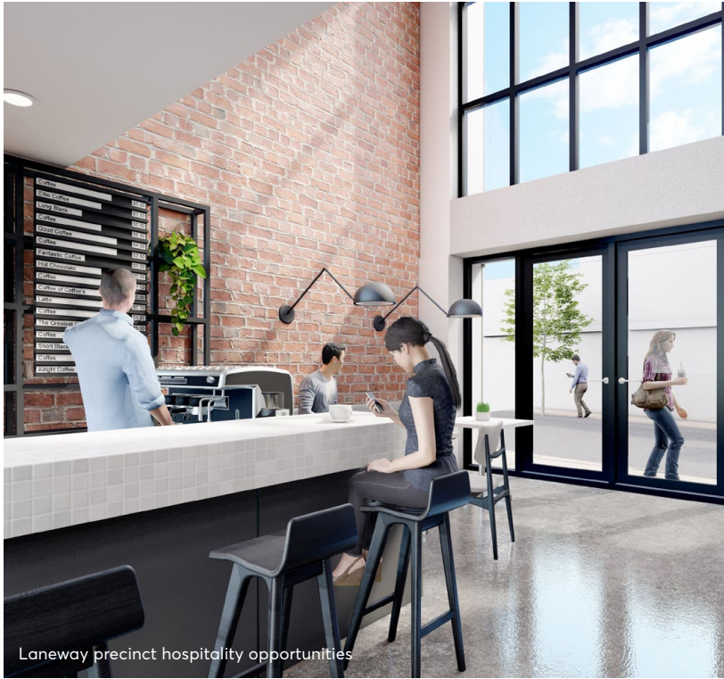
Laneway precinct hospitality opportunities