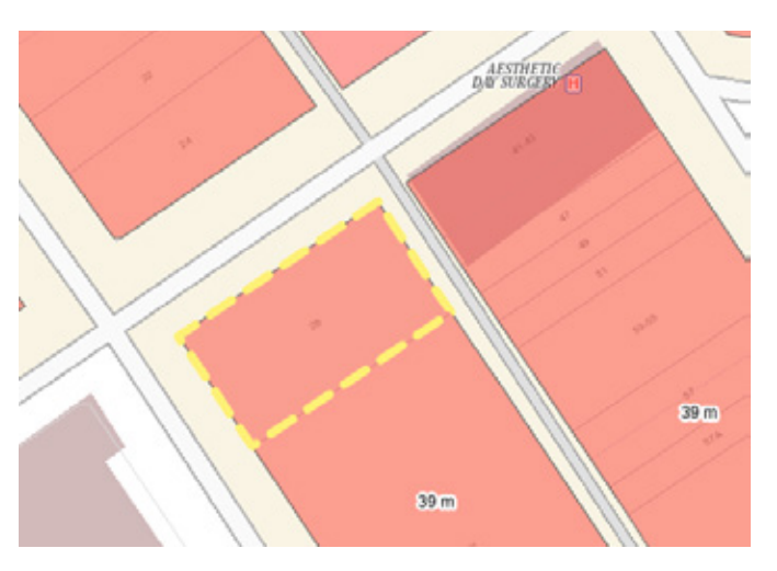
Height of Building