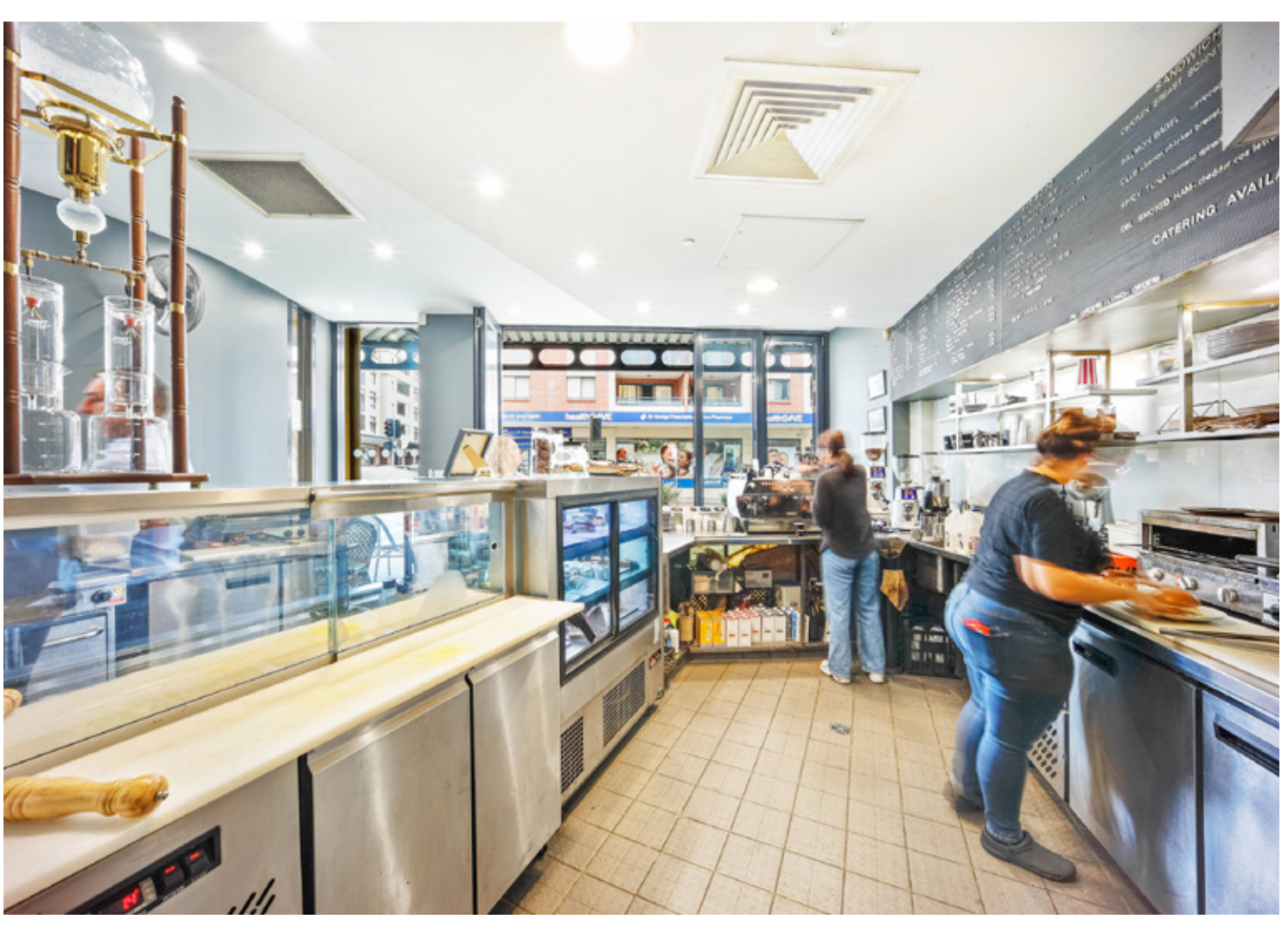
Shop 4/26 Belgrave Street, Kogarah | Page 11