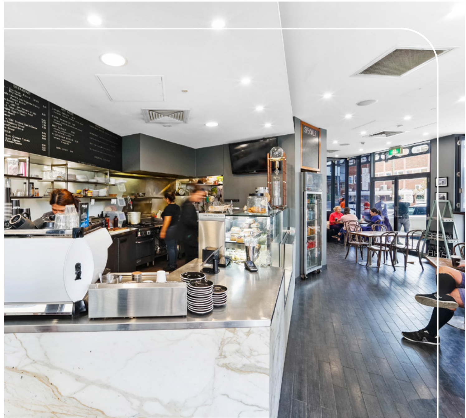
Information Memorandum | Shop 4/26 Belgrave Street, Kogarah