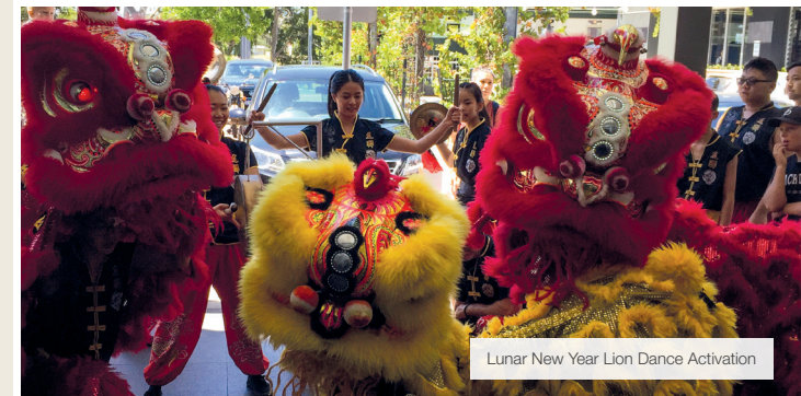
Lunar New Year Lion Dance Activation