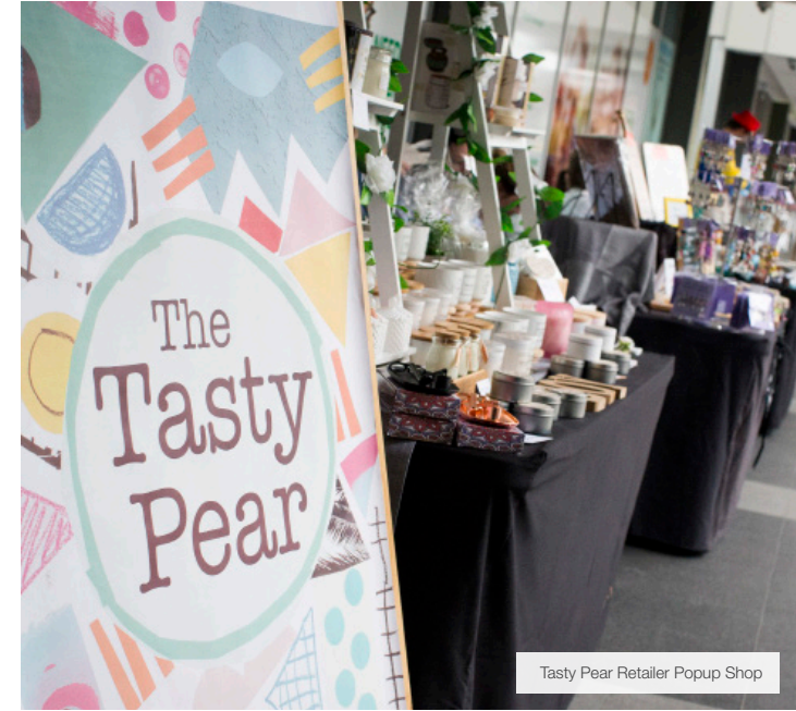
Tasty Pear Retailer Popup Shop

The introduction of numerous residential apartment complexes within walking distance to the centre provides a growing captive market as well as revitalisation of the area.