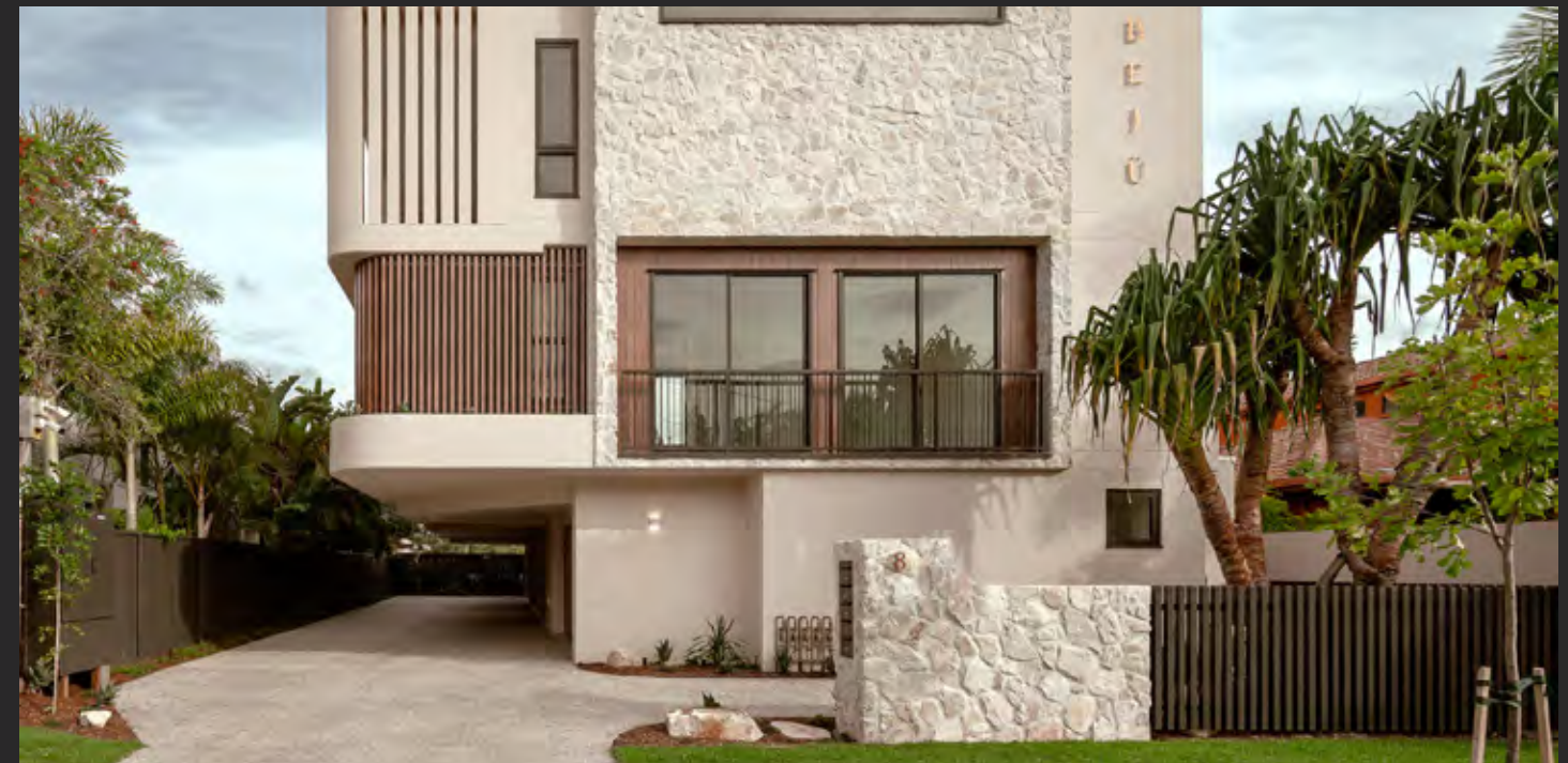
1-4/8 Bullimah Avenue, Burleigh Heads 3 Bedroom 2 Bathroom 2 Car with Lift Sold $2,350,000