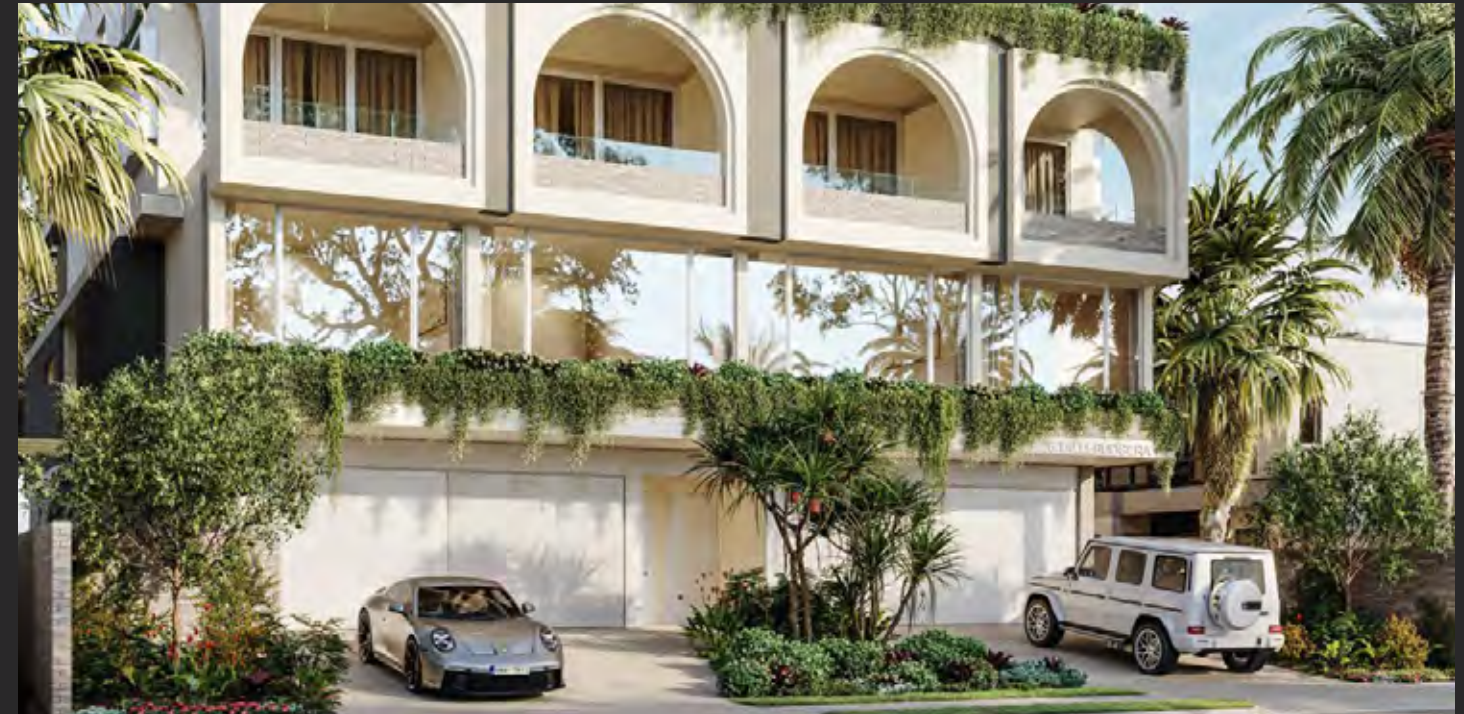
1-4/26 Tallebudgera Drive, Palm Beach 3 Bedroom 3 Bathroom 2 Car (Tandem) across 4 levels Prices from $2,095,000