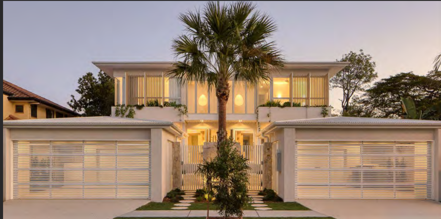
1-2/70 Tallebudgera Drive, Palm Beach 4 Bedroom 3 Bathroom 2 Car (Carport) across 2 levels Sold $2,400,000 in October 2023