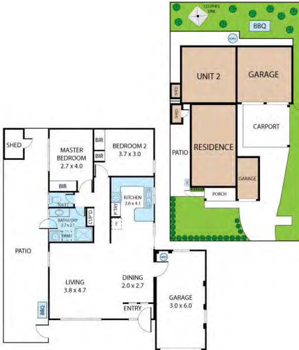
1/15 Tallebudgera Drive, Palm Beach