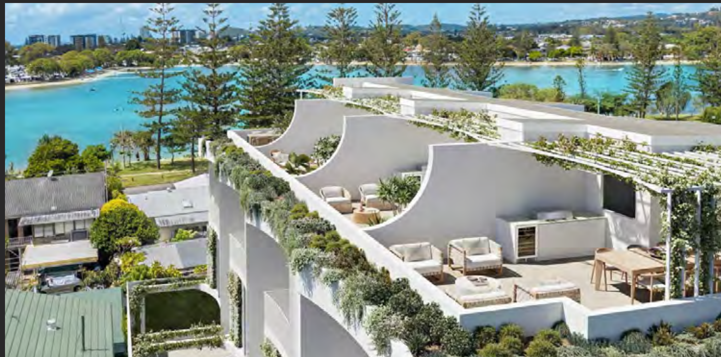
1-4/24 Bullimah Avenue, Burleigh Heads 3 bedroom 2 Bathroom 2 Car Garage across 4 levels Sold $2,095,000 in September 2023