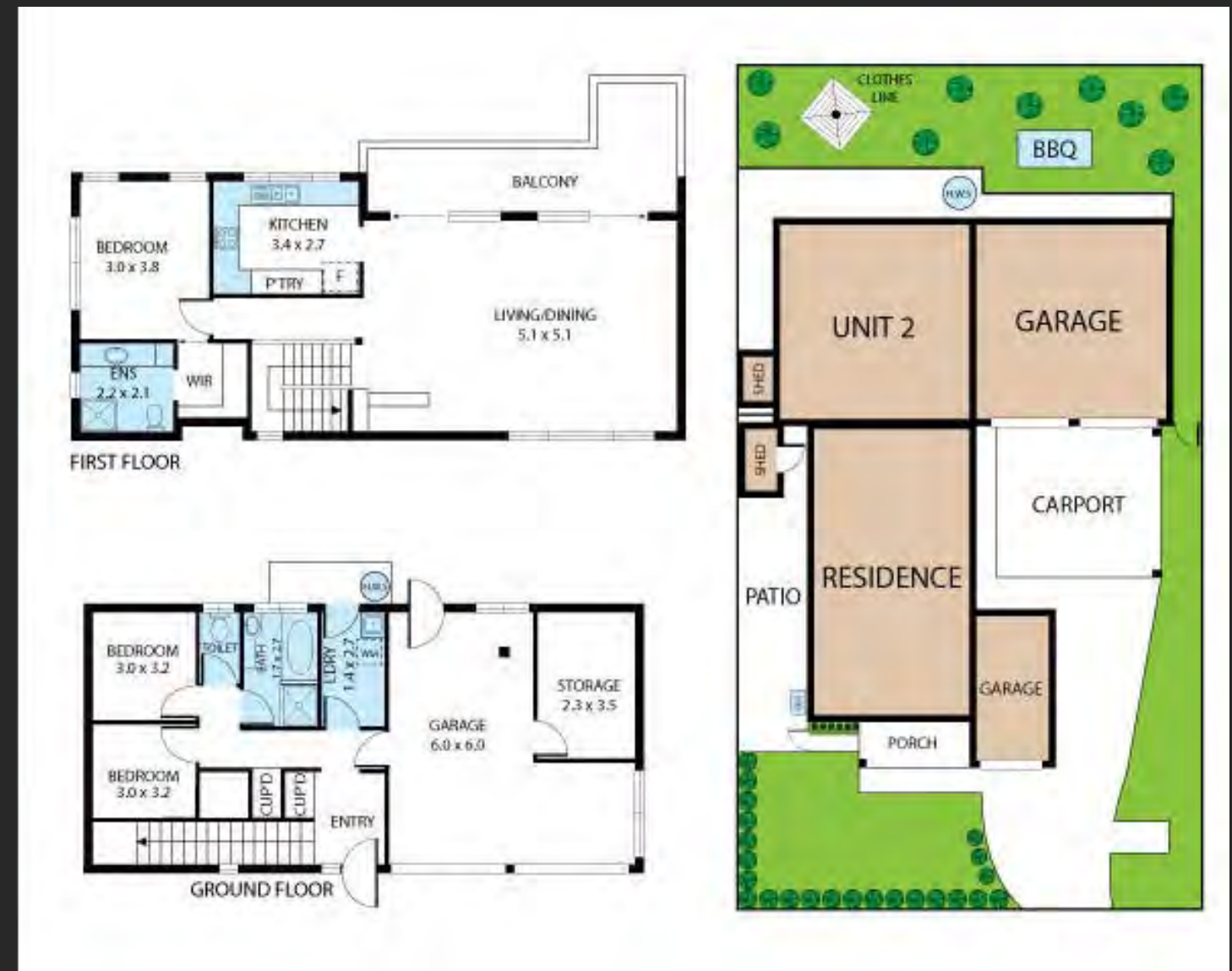
2/15 Tallebudgera Drive, Palm Beach