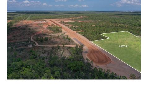
FOR LEASE: Lot 4

Lot 3 provides a versitile range of lot sizes, catering to all aspects of downstream processing.