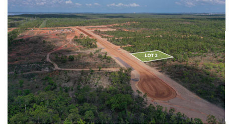
FOR LEASE: Lot 3

Size: 147,000m<sup>2</sup> approx. Lot 2 provides the first lot of Kittyhawk Estate Stage 1 - optimally positioned at the entrance of the estate.