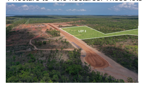
FOR LEASE: Lot 2

Construction is currently underway at Stage 1 of Kittyhawk Estate which will provide 3 lots for sale ranging in size from 1 hectare to 16.5 hectares. These lots are available for strategic investment and are set to be completed early 2021.