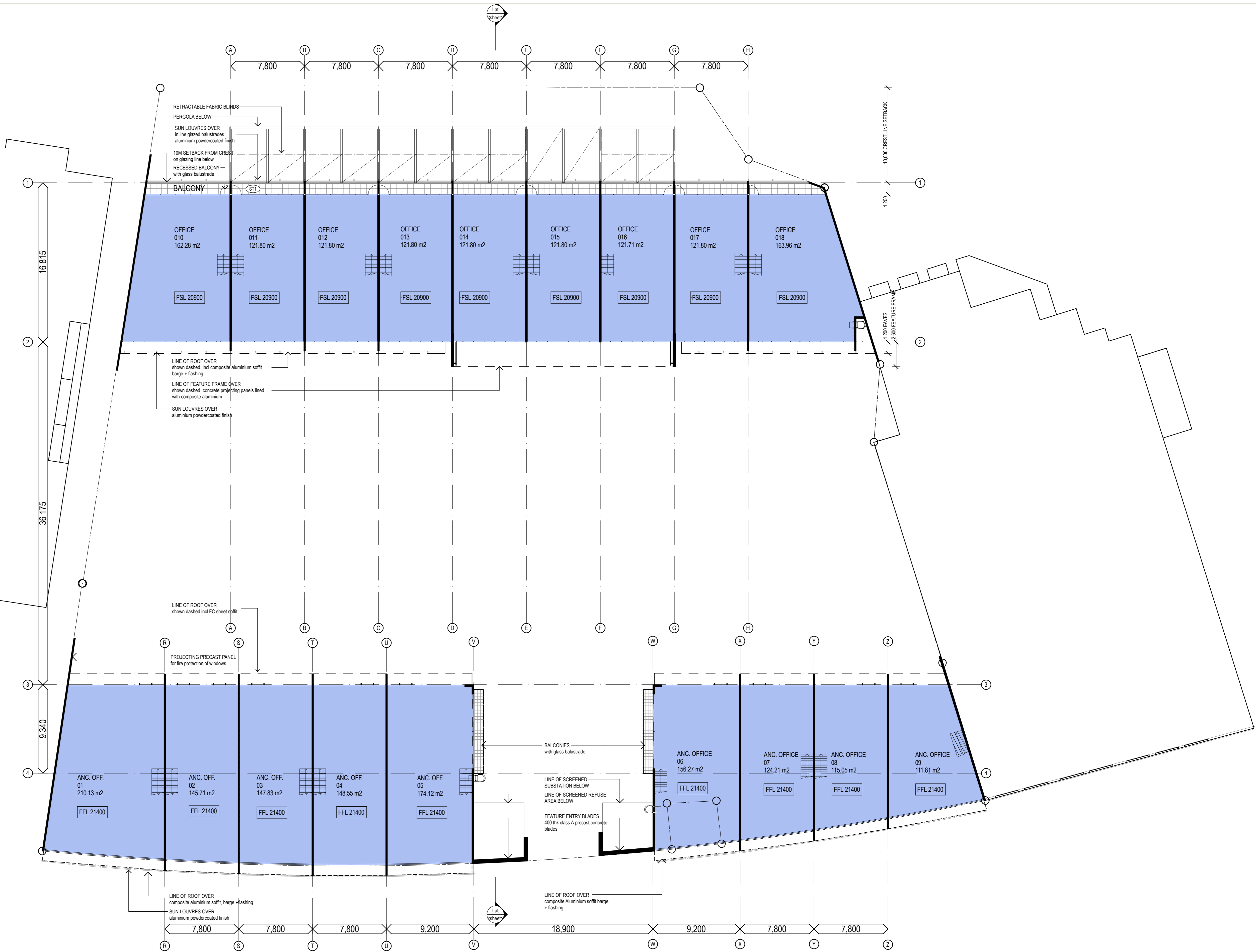
1 FLOOR PLAN - LEVEL 01 SCALE @ A1 1:200

0 2 4 6 8 10 12 14 16 18 20 SCALE 1: 200 @ A1 SCALE 1: 400 @ A3 metres