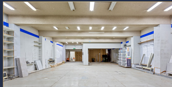
LARGE AND HIGHLY FLEXIBLE GROUND LEVEL RETAIL SPACE