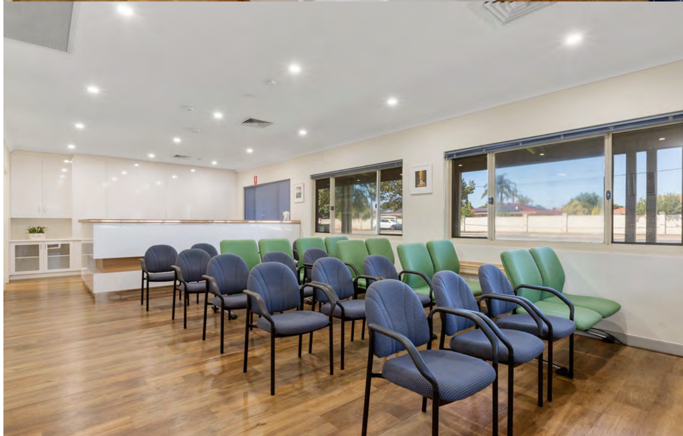
Units 1&2 / 288 High Road Riverton WA