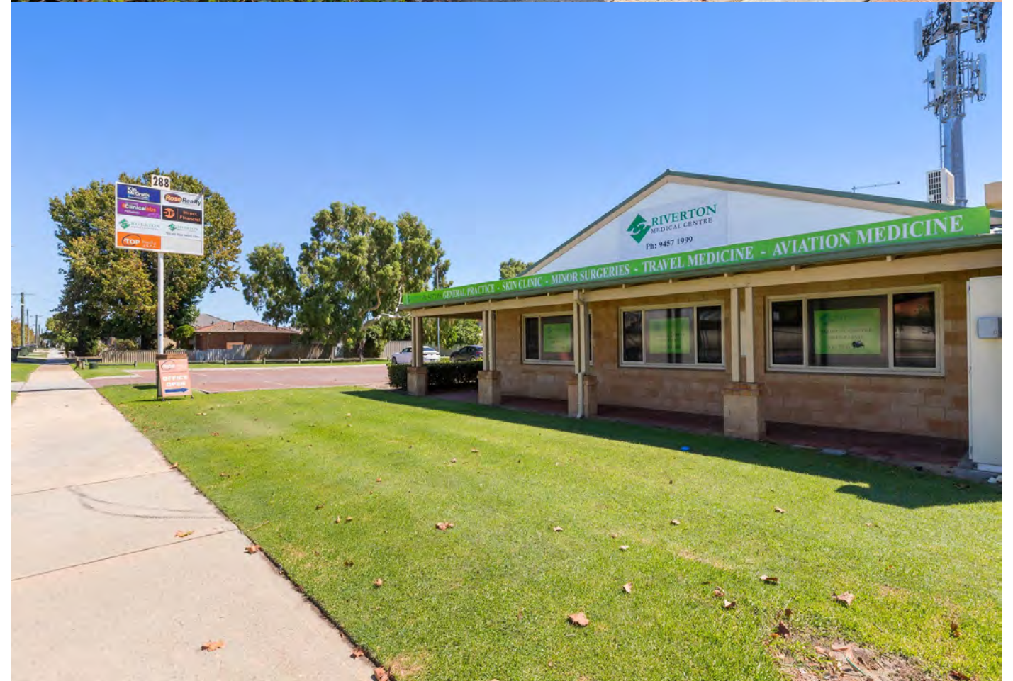
Units 1&2 / 288 High Road Riverton WA