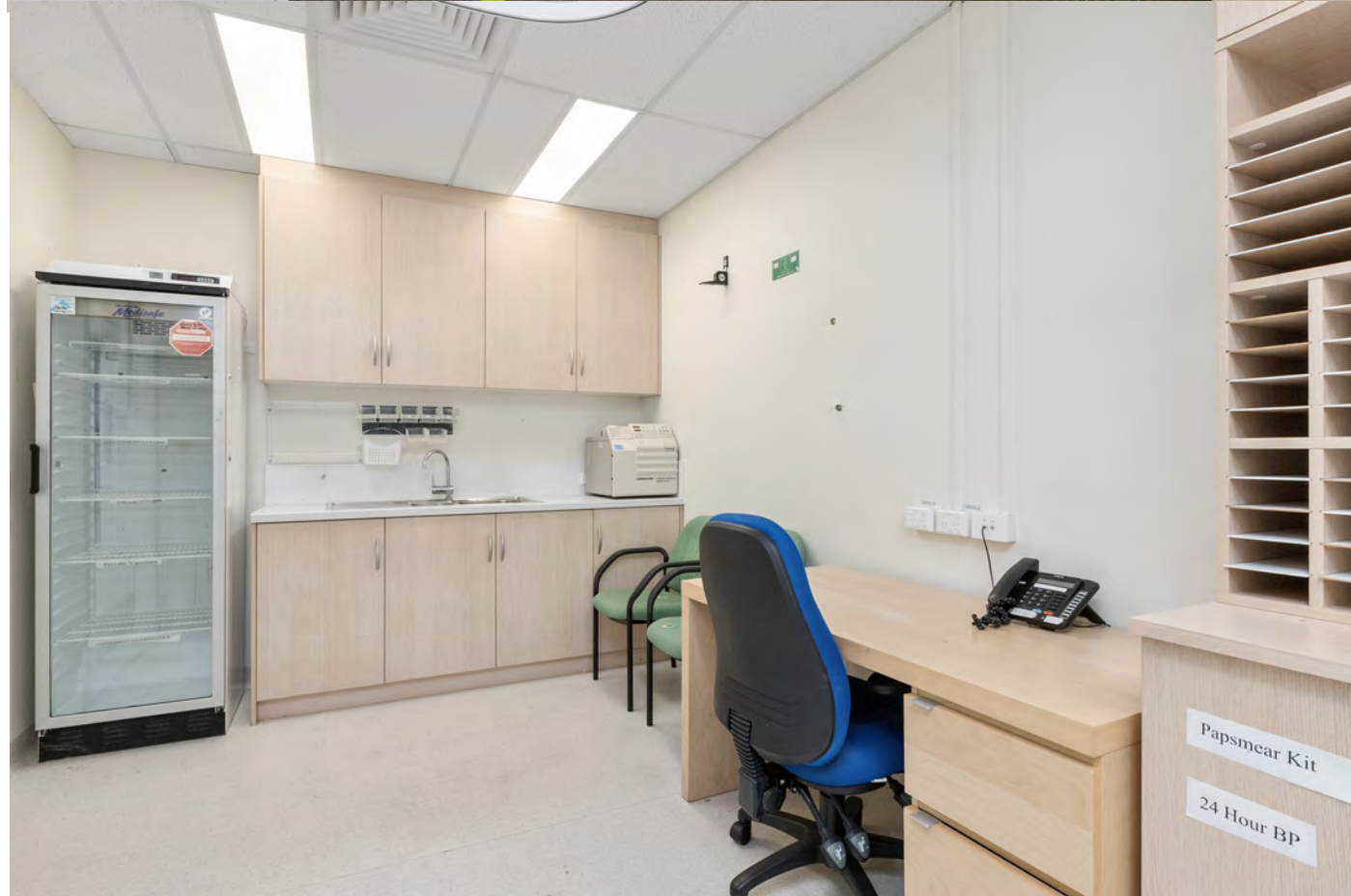
Units 1&2 / 288 High Road Riverton WA