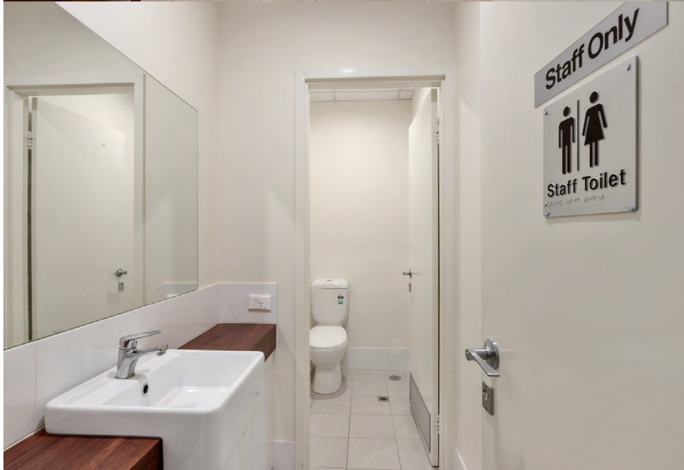
Units 1&2 / 288 High Road Riverton WA