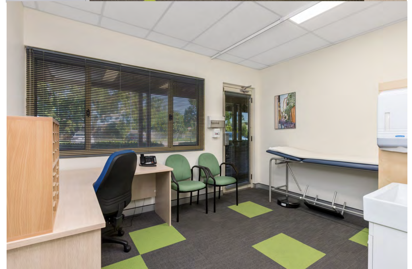
Units 1&2 / 288 High Road Riverton WA