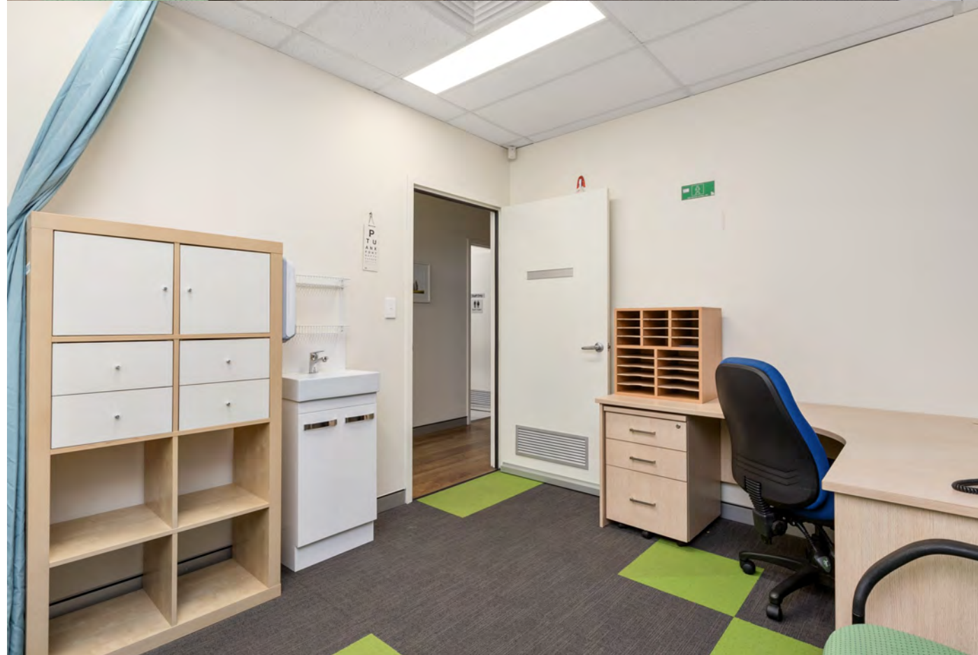
Units 1&2 / 288 High Road Riverton WA