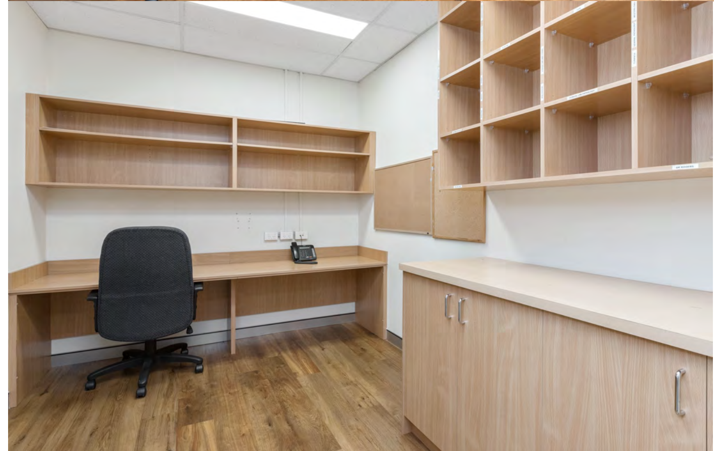
Units 1&2 / 288 High Road Riverton WA