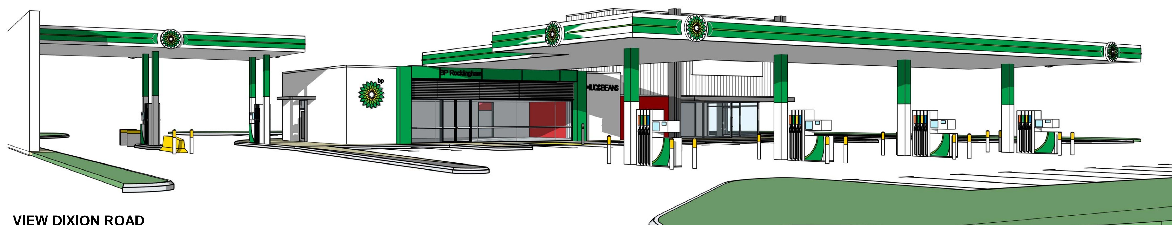
VIEW DIXON ROAD