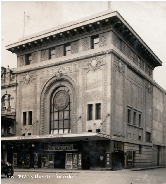
Lost 1920's theatre facade