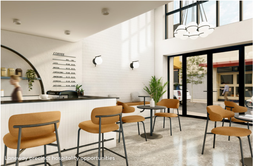
Laneway precinct hospitality opportunities