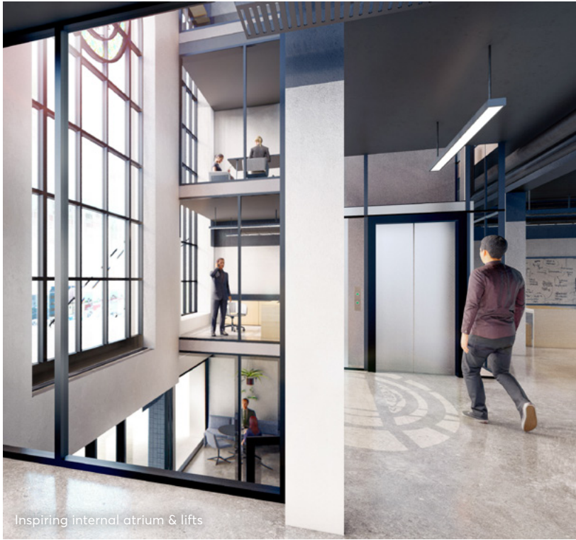
Inspiring internal atrium & lifts