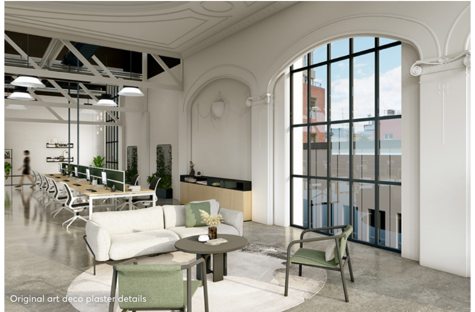
Original art deco plaster details