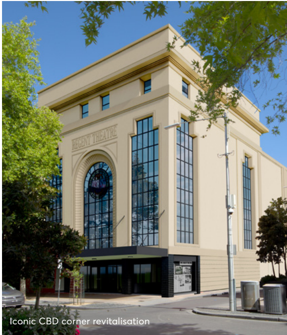
Iconic CBD corner revitalisation