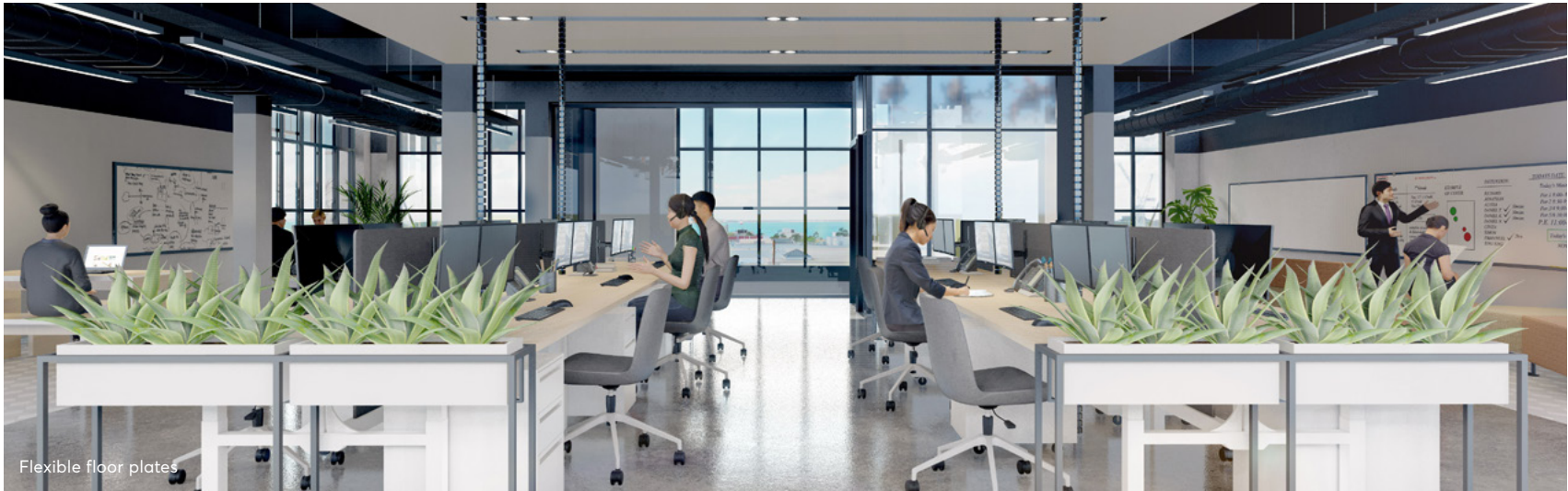
Flexible floor plates