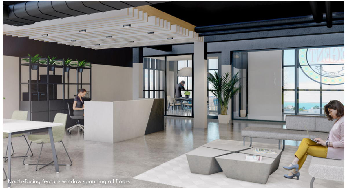
North-facing feature window spanning all floors