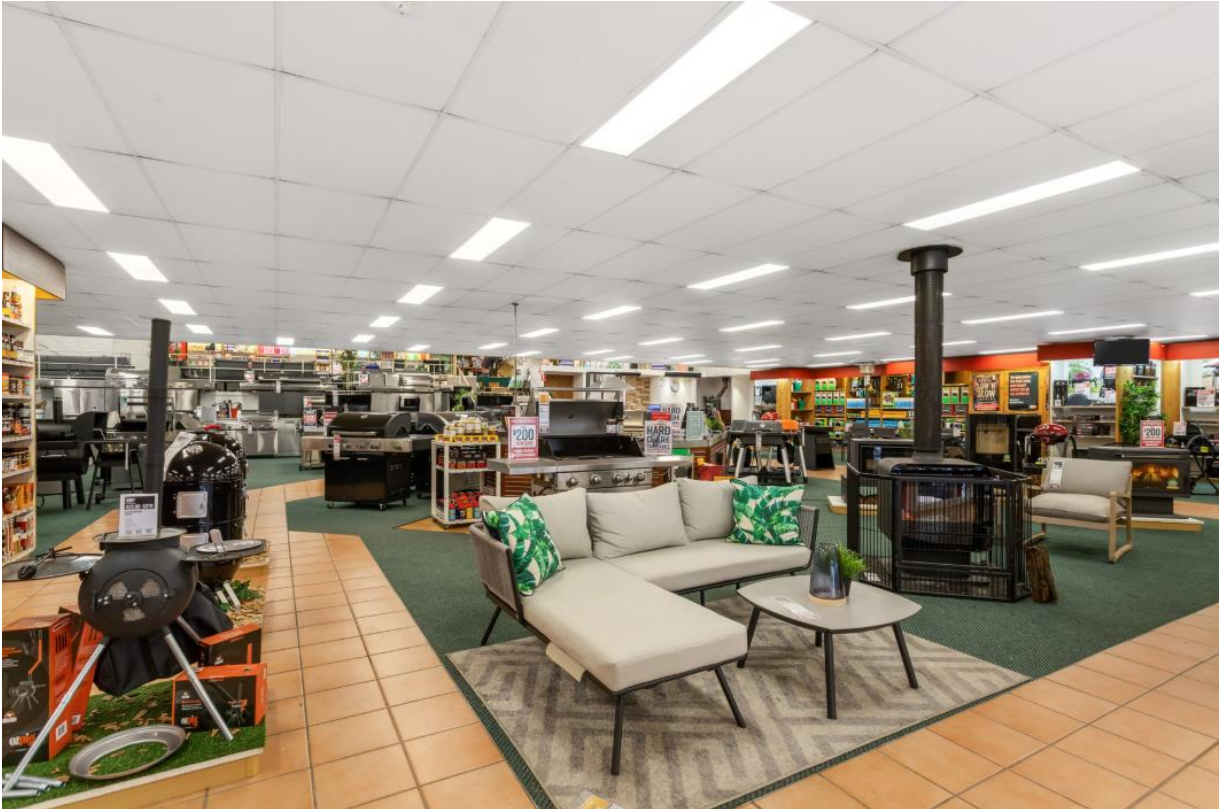
LPC Cresa | 10 Eagle Street, Level 19 | Brisbane

Even though obtained from sources deemed reliable, no warranty or representation, express or implied, is made as to the accuracy of the information herein, and it is subject to errors, omissions, change of price, rental or other conditions, withdrawal without notice, and to any special listing conditions imposed. All amounts quoted are GST exclusive and subject to taxes.