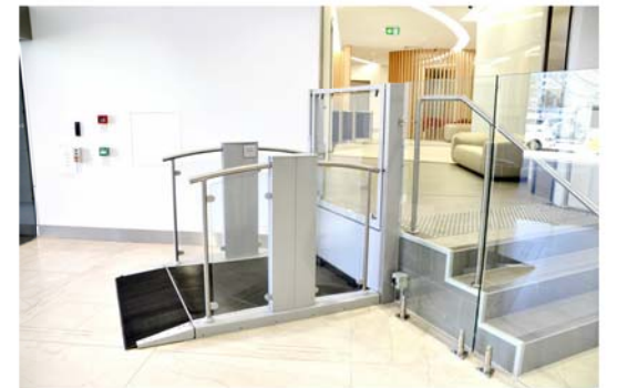
PROPOSED PLATFORM LIFT - FINISH: BLACK