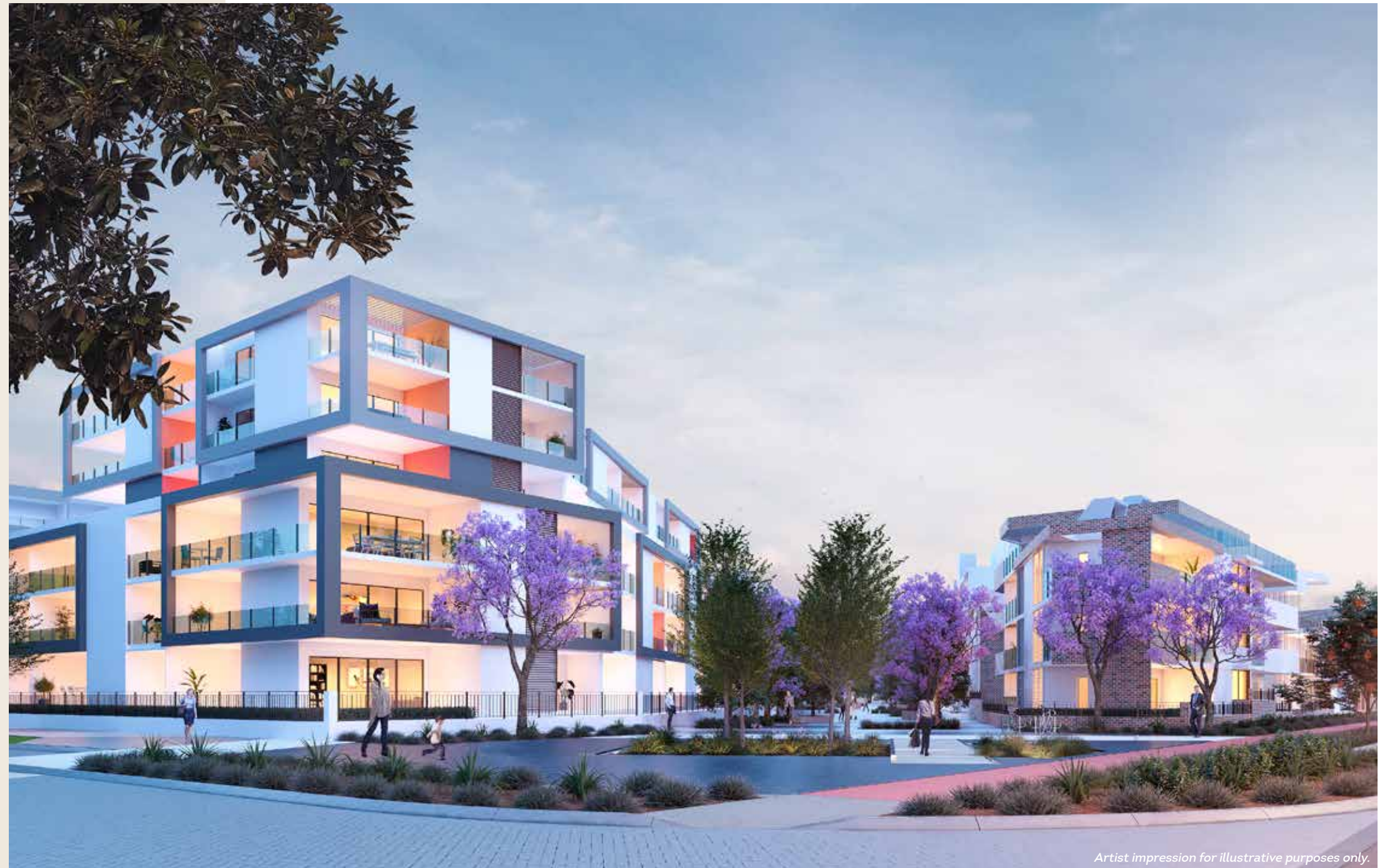
Artist impression for illustrative purposes only.