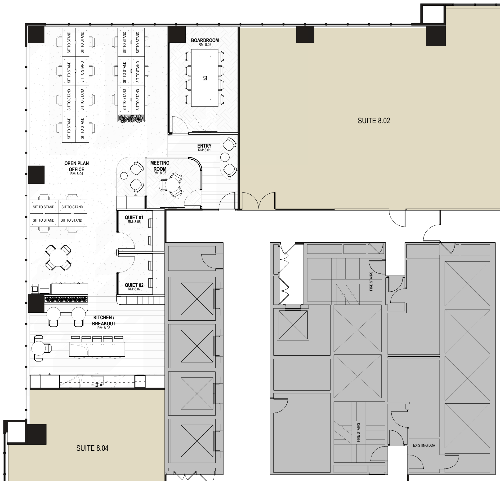
1 LEVEL 8 FLOOR PLAN 1 : 100