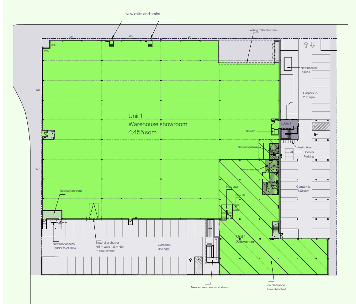
Note: all areas are subject to final survey.