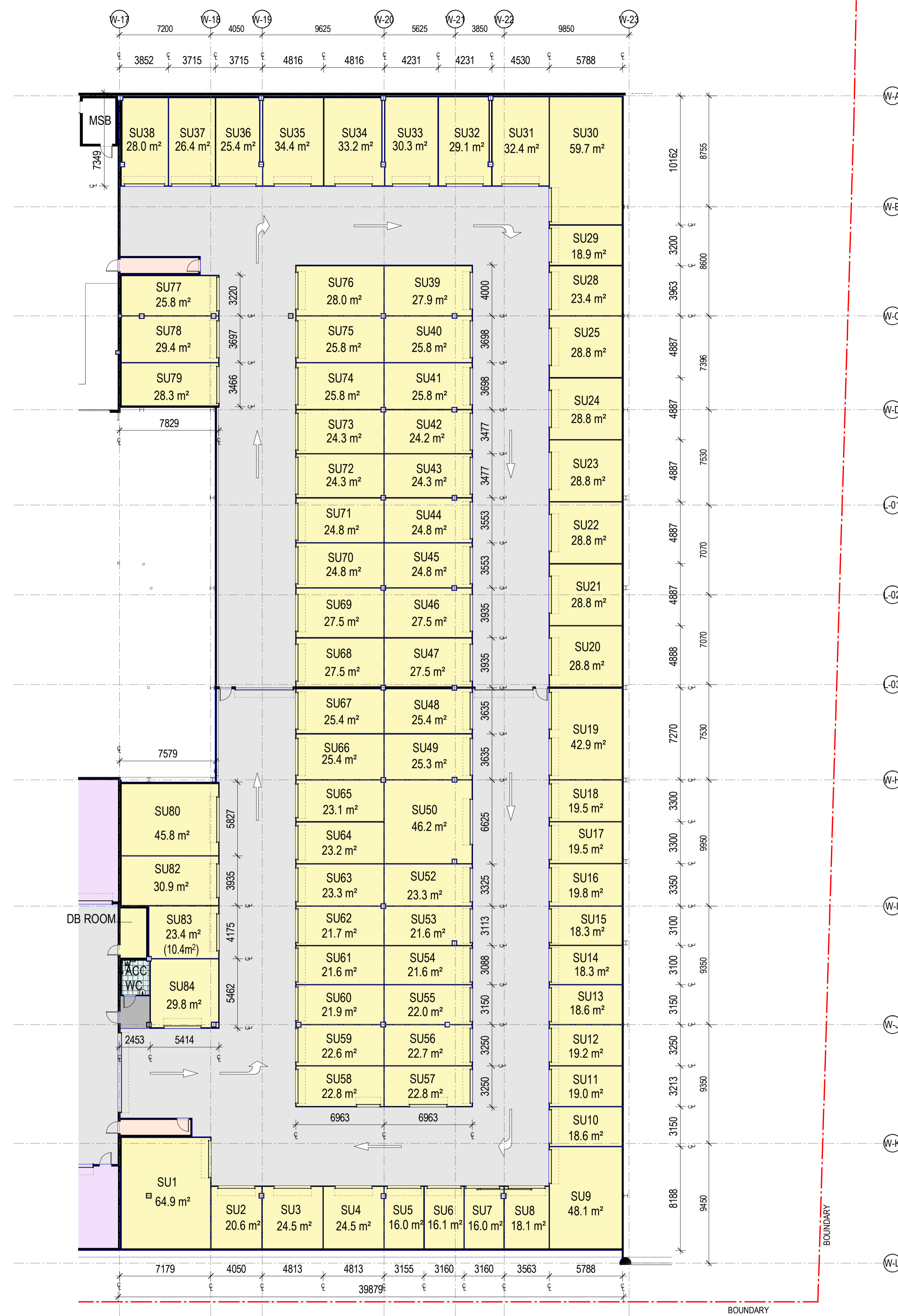
1 GROUND LEVEL - STORAGE UNITS 1 : 200 DA301