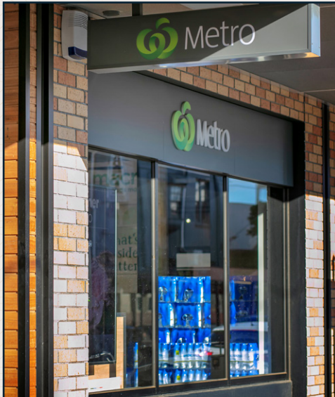
WOOLWORTHS METRO 60M* AWAY