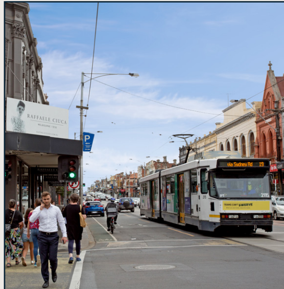
SYDNEY ROAD TRAMS AND RETAIL