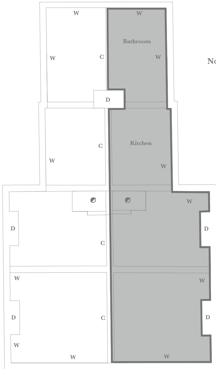
GROUND LEVEL: 44sqm