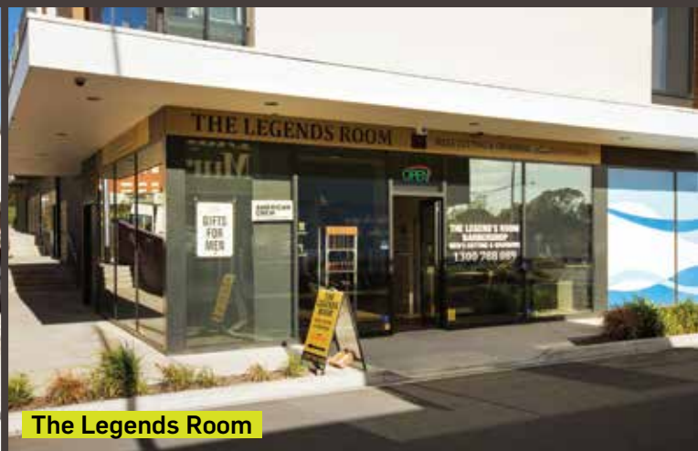
The Legends Room

4 quality retail investments in thriving location