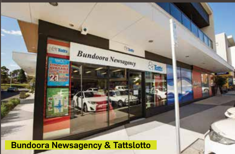
Bundoora Newsagency & Tattslotto