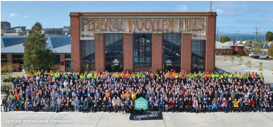
Join our professional community