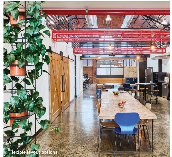
Flexible layout options

We offer Australia's fastest commercial internet.