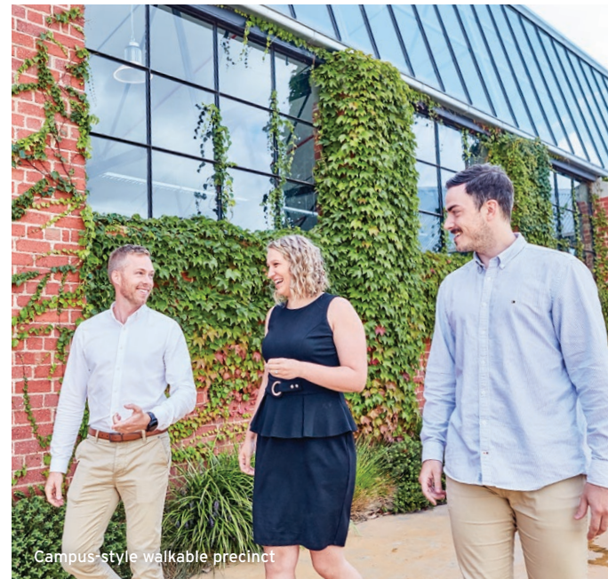
Campus-style walkable precinct