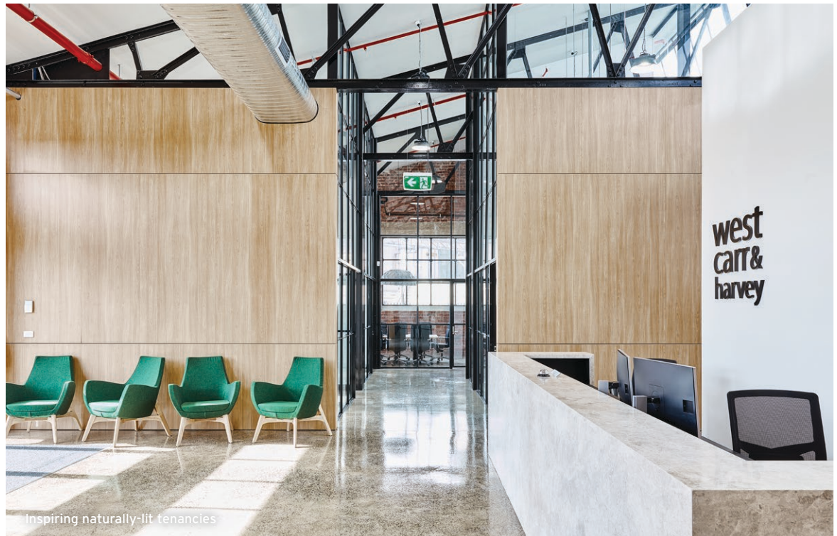
Inspiring naturally-lit tenancies