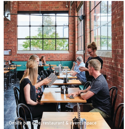
Onsite bar, cafe, restaurant & events space