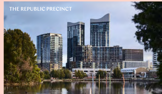
THE REPUBLIC PRECINCT