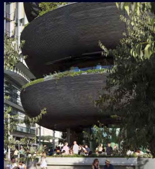
Barangaroo South Public Domain

Oculus is a cross-disciplinary design studio creating projects in the public domain that aspire to be challenging, contemporary and multi-dimensional. As urban designers and landscape architects concerned with public space, their work addresses the conditions which contribute to the on-going success of a place: socially, culturally, economically and environmentally.