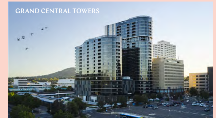
GRAND CENTRAL TOWERS