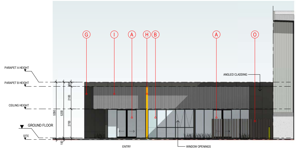
OFFICE B - SOUTH ELEVATION SCALE: 1: 100