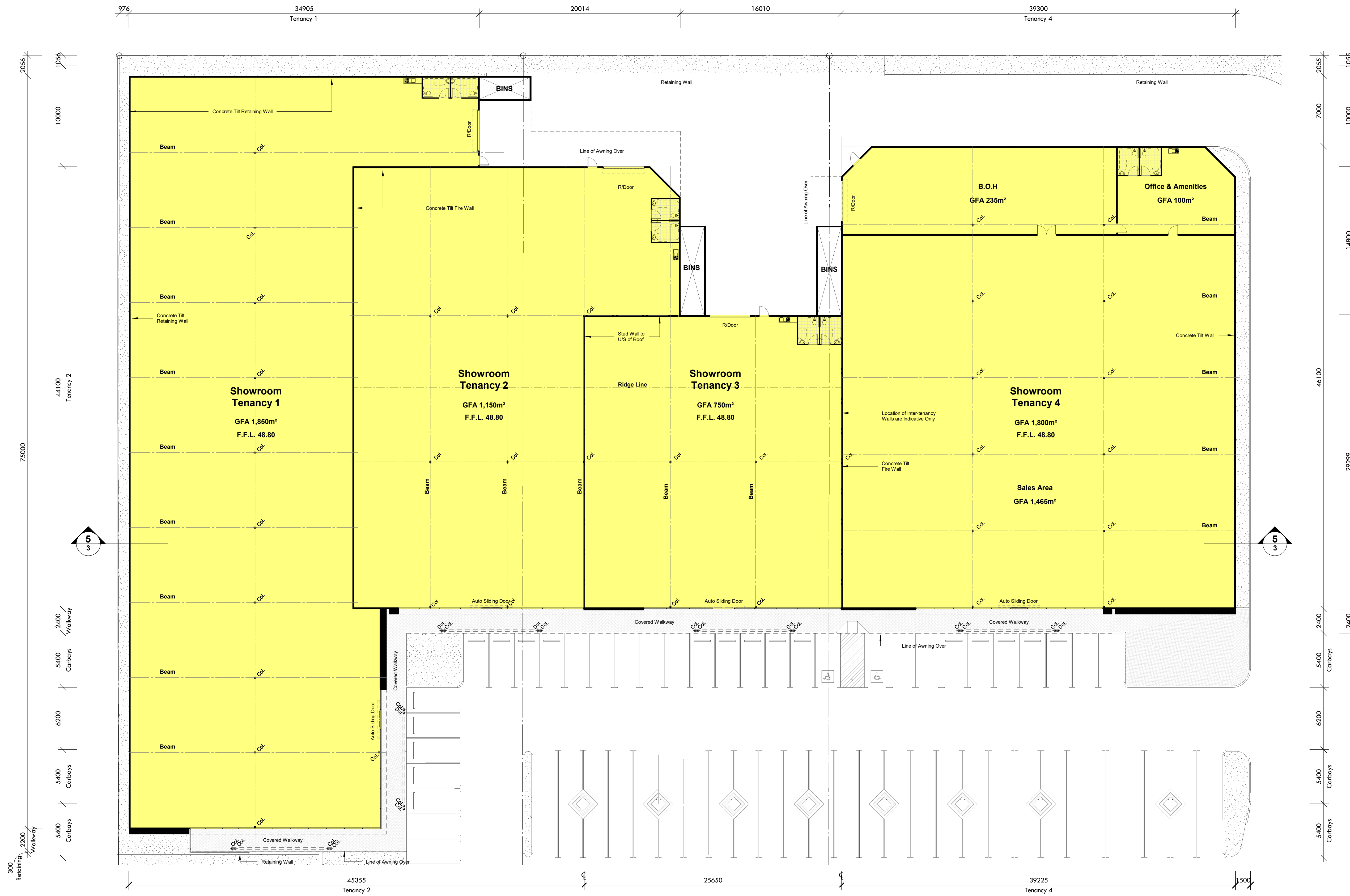
GROUND FLOOR PLAN SCALE: 1:200

PROPOSED LARGE FORMAT RETAIL DEVELOPMENT LOCATION: 7, 11, & 15 (LOT 20,61,62) CHESTER PASS ROAD, ORANA WA FOR: PWD BY: VEND PROPERTY