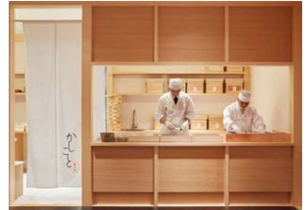
SHOPFRONT PRECEDENTS + MATERIALS