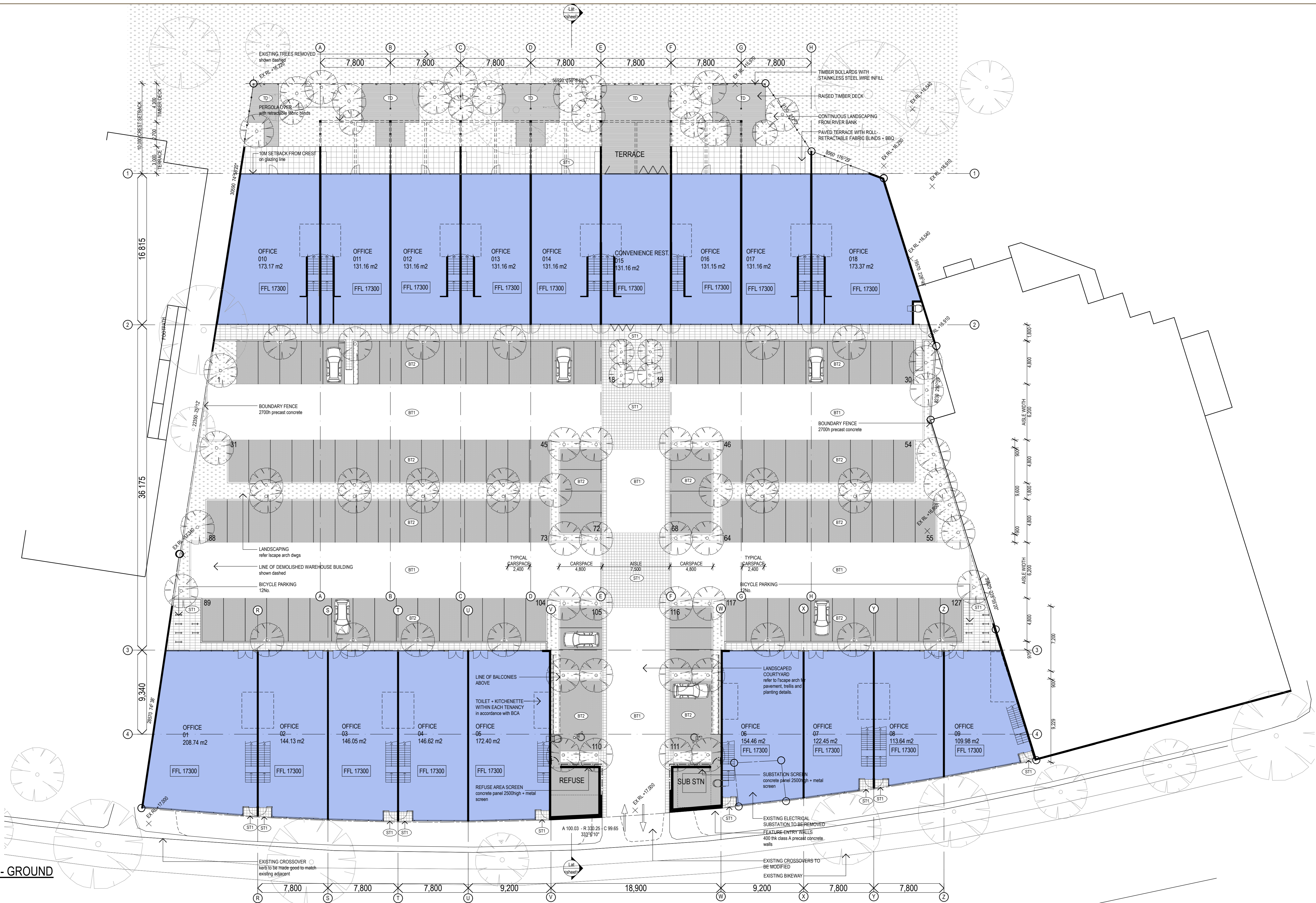
1 FLOOR PLAN - GROUND SCALE @ A1 1:200

0 2 4 6 8 10 12 14 16 18 20 SCALE 1: 200 @ A1 SCALE 1: 400 @ A3 metres