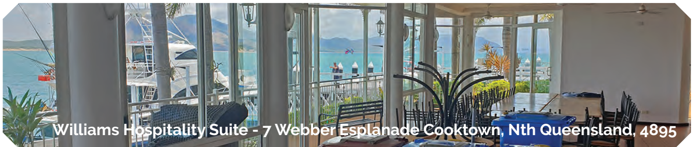
Williams Hospitality Suite - 7 Webber Esplanade Cooktown, Nth Queensland, 4895