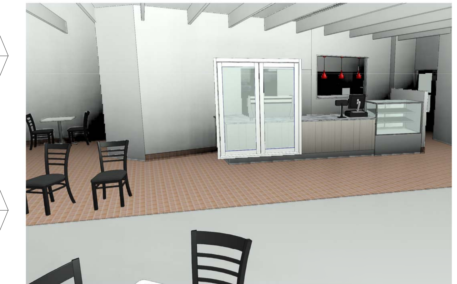
4 Perspective View - Internal FRONT WALL REMOVED