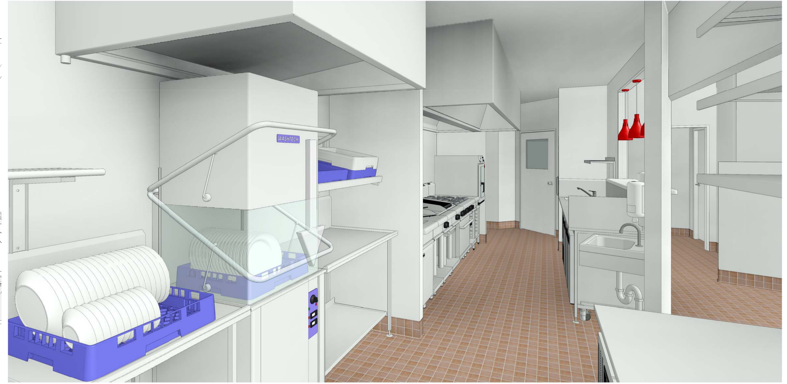
3 Perspective View - Internal

TRANSPARENT WALLS INDICATIVE CEILINGS / BEAMS