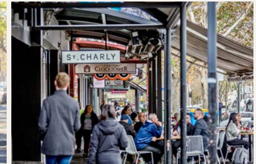
BUSTLING LYGON PRECINCT