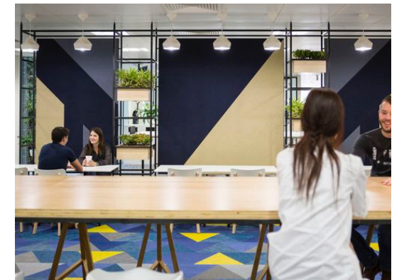
informal meeting in reception example