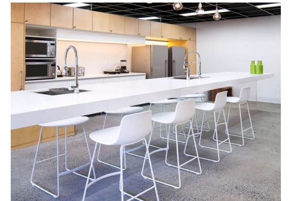
kitchen in reception example

Copyright 2011 Powerhouse Group Pty Ltd. / We understand that reproduction of whole or part of this document constitutes an infringement of copyright. / We acknowledge that this document is confidential and as the recipient of this document, are prohibited from disclosing such information, and/ or concept to any other person or company without prior written consent from Powerhouse Group Pty Ltd.