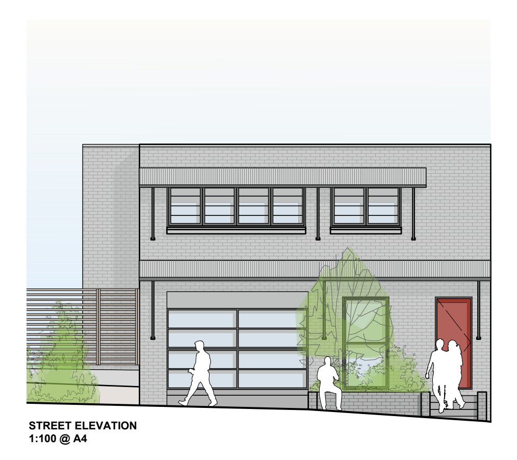
21 CHUTER STREET McMAHONS POINT